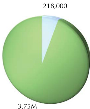
U.S. Renewable Energy and Energy Efficiency Industries in 2007